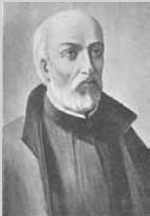
St. John de Brebeuf