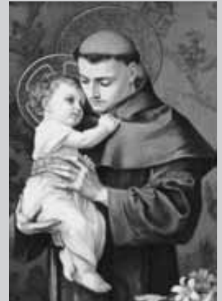
St. Anthony of Padua

Masses: Saturday 5:00 p.m. Sunday 8:30 a.m.